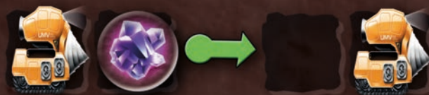
Orange drills an adjacent "Iridium".

A player wishing to drill a resource tile simply takes an adjacent resource from the game board and places it into an empty cargo bay on their player mat, and moves their UMV figure into the space where the resource was. Players may not drill into a resource tile if they have no empty cargo bays available.