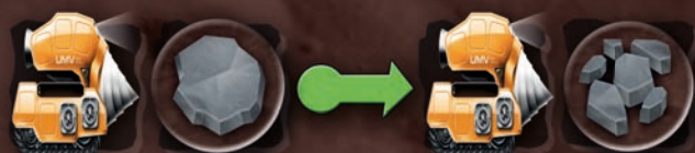
Orange drills an adjacent "Solid Rock" tile.

A player wishing to drill an adjacent solid rock tile simply turns the tile over, revealing the rubble side of the tile. The player does not move their UMV piece.