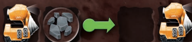
Orange drills into a rubble tile.

A player wishing to drill an adjacent rubble tile removes the rubble tile from the board, discarding it to the box and moves their UMV piece into the space the rubble occupied.