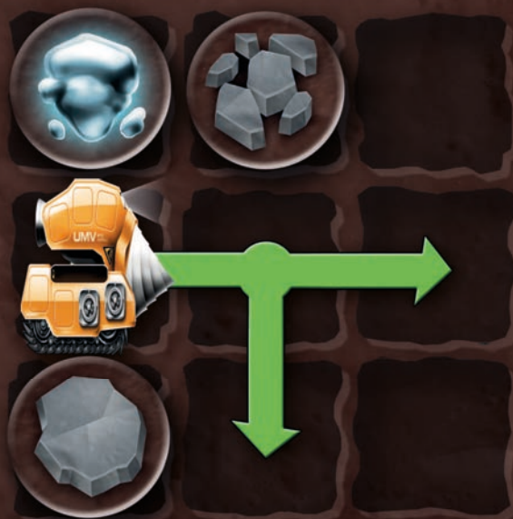
Orange's possible movement options

DRIVE. Move up to 2 spaces, and up to 1 additional space per rocket acquired.