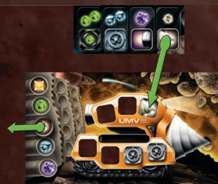
Orange builds a drill bit.

Players have a total of 5 expansion bays on their player mat. In order for a player to build equipment, they must pay the resources indicated for that piece of equipment in the workshop. Then they may take the equipment from the warehouse and place it into an empty slot in their player mat.